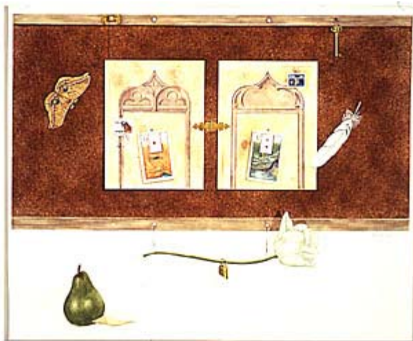
Pasquaide (Watercolor – 33" x 38") 1998