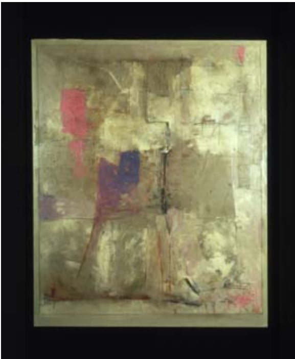
Bodice (Acrylic – 75" x 61") 1998