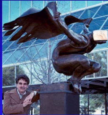
The Leaper by Roy Shifrin