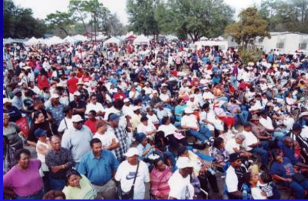
Zora Neale Hurston Festival

Audience intercept interviews were conducted at the Association to Preserve Eatonville Community's Zora Neale Hurston Festival, the Enzian's Florida Film Festival and the Orlando Museum of Art's Chihuly Across Florida Exhibition. The training sessions prepared interviewers to ask targeted questions so we could accurately identify incremental visitors; those out-of-area visitors whose main reason for coming to Orlando was to visit the festival or exhibit—people who would not be here spending money in our community if it weren't for that specific cultural event, and if they had not heard about that cultural event.