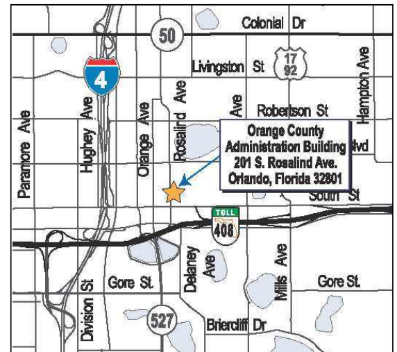
Public Hearing Location Map