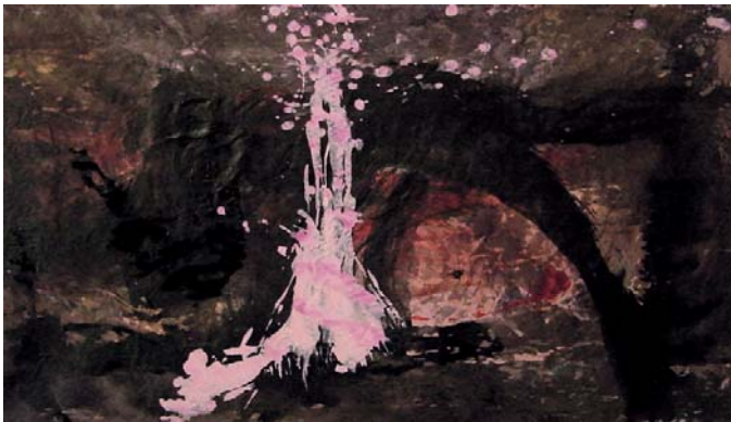
Lilac Brush 1 – (45 x 23") Acrylic & Enamel on Canvas, 2007

I specialize in site-specific commissions and am passionate about painting large scale formats for interior and exterior environments. My works can be seen in a growing number of private, corporate and public collections. Studio visits are welcomed by appointment.