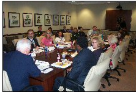
A panel of experts discusses the dangers of marijuana and its abuse by children