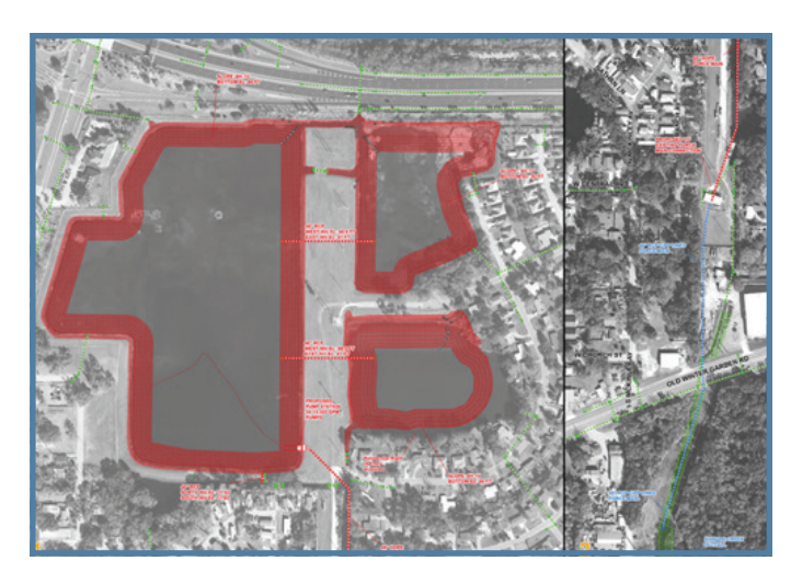
Figure 1 - Orlo Vista Improvements