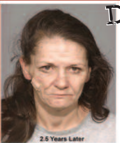
2.5 Years Later