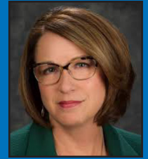
Orange County Mayor Teresa Jacobs