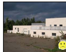
Unarticulated roof lines