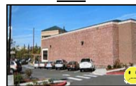
Blank wall areas prohibited