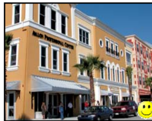
Good facade solution