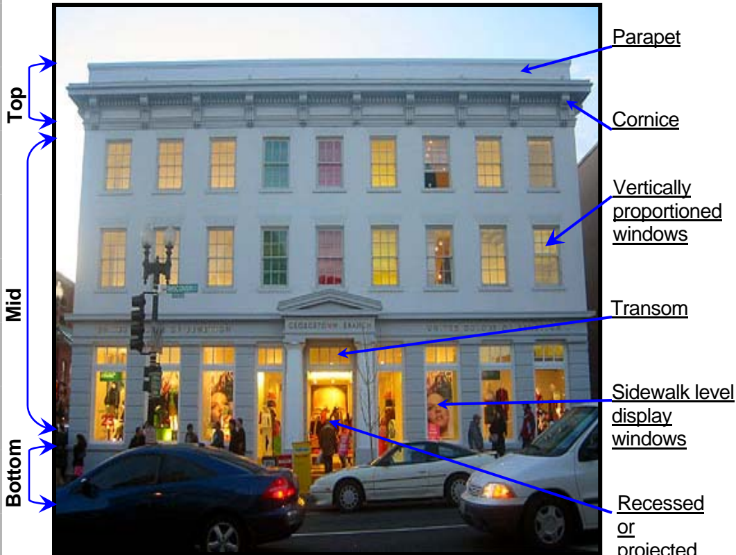
Components of a Building Facade