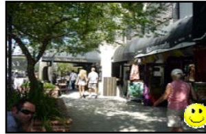
Shade and windows