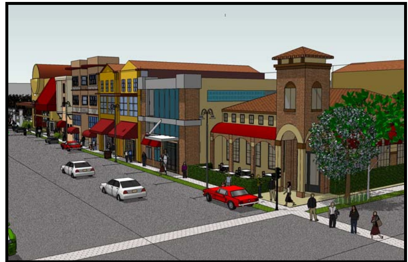
Roof line variations and facades which are compatible with the surrounding area