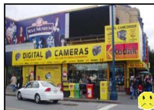
Backlit awnings prohibited